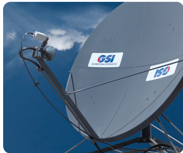
Pictured: Mobile office interior and satellite.